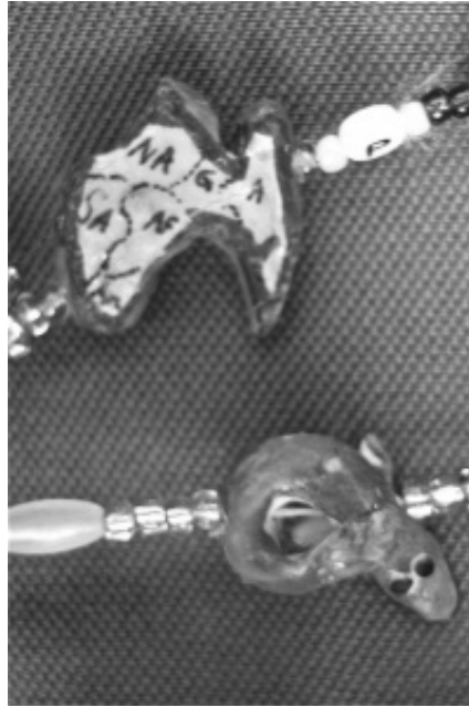
Fig. 2. Beads Hand-Made Using Clay

fossil, a stone arrowhead, a coin, a computer chip, or any other object which works well to represent the chosen event. If none of those produces a bead fitting the chosen event, then clay (skulpt or conventional) can be used to fabricate the bead (see Fig. 2). Note that so called 'permanent' markers often fade over time, so paint covered by a clear coating is preferred for longevity. For longer Big History bead sets, clasps (such as barrel clasps, lobster claw clasps, wire wrapping, or others) can be included at points along the string. This makes it easier to add, remove, or replace beads nearby by allowing a break point to access the local beads, avoiding the need to remove and restring the entire set of Big History beads. Also, many options for cord exist for stringing the beads. The most durable option is stranded bead stringing wire available at many craft stores. Copper wire, fishing line, and many kinds of thread should be avoided because they tend to break over time. Thin hemp or other plant fiber cord is a useful option if an intentionally weaker bead strand is desired (e.g., members of households with small children may desire a weaker strand to avoid a strangulation hazard).