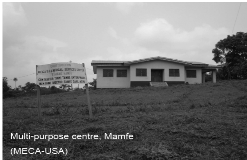
Multi-purpose centre, Mamfe (MECA-USA)